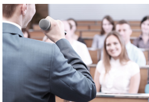
Law courts and conference halls